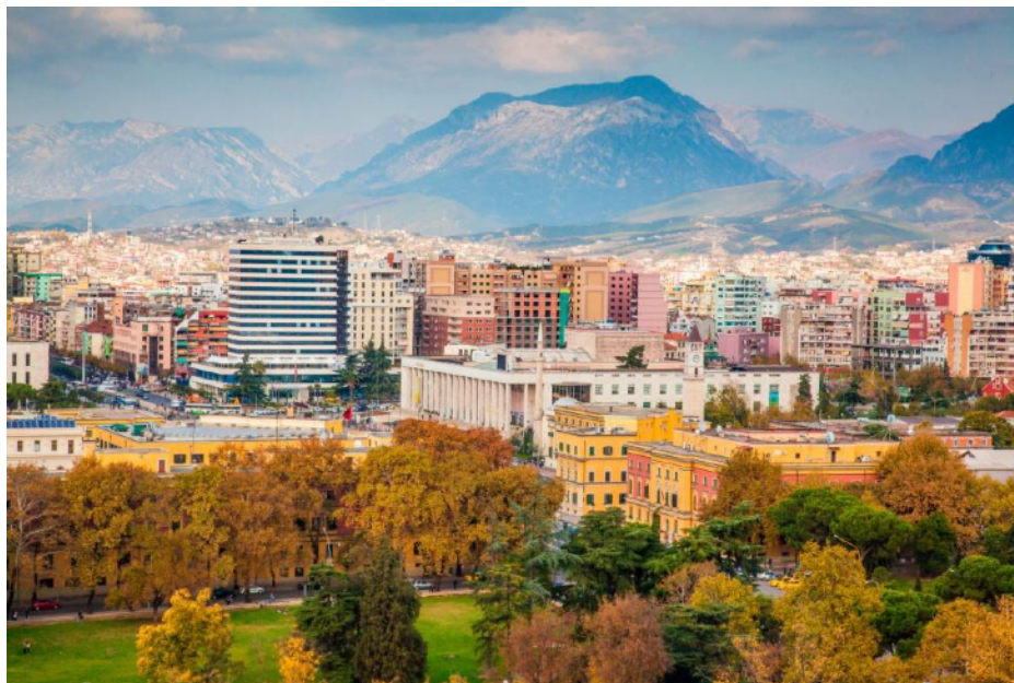
Tirana with Dajti Mountains

Albania is directly east of Italy and has a Mediterranean climate. Bring rain gear as showers are always possible.